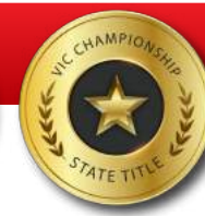
PRO SPRINTS VIC TITLE